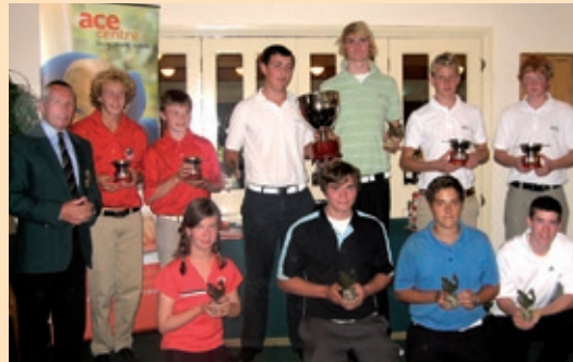
Left: The winners of the inaugural ACE Centre Junior Golf Challenge

Our payroll and direct debit donors continue to support us monthly providing us with much needed general funds of £8,700 per year.